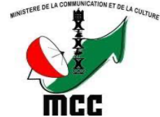
THE MINISTRY OF COMMUNICATION AND CULTURE