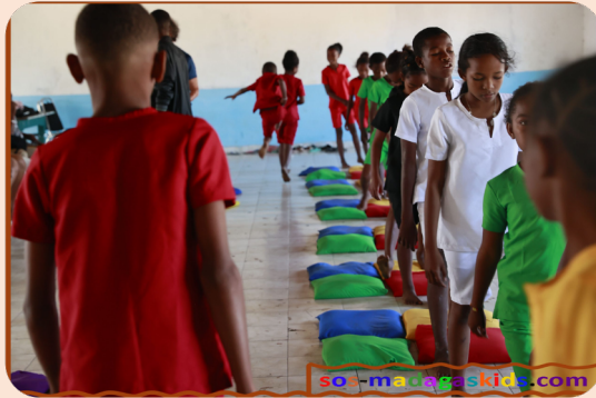
Financial partner: private donor

Regarding the city of Morondava, many educational and supervisory challenges arise for families and especially for children. It is at the Namahora-Nord Public Primary School in Morondava that SOS-MADAGASKIDS decided to establish itself in 2023-2024 to help local children face the lack of educational quality and the difficulty of the administration to respond effectively to the demand of Malagasy society. The "Training" programme for parents, teachers and staff is developed there. To identify potential problems related to the proper development of young children, we carry out a series of activities. This will result in an overall strategy fully adapted to the identified needs. In this context, group work was carried out and allowed participants to reflect on the messages to convey. Several ideas emerged, with messages such as: "the place of children is at school". Our partners also propose various activities to identify vulnerable children, such as the "free drawing" activity which will give social workers an opportunity for an initial analysis of their psycho-social needs.