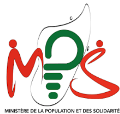
THE MINISTRY OF POPULATION AND SOLIDARITIES