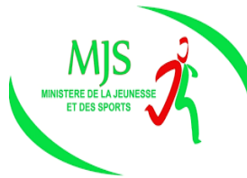
THE MINISTRY OF YOUTH AND SPORTS