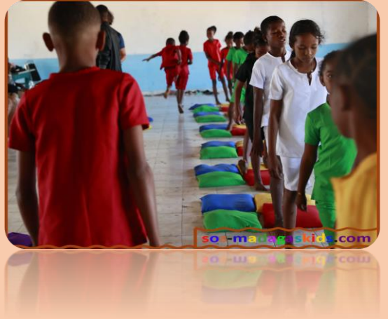
Financial Partner: Private donor

Our partners are also proposing various activities to identify vulnerable children, such as the "free drawing" activity, which will give social workers an initial analysis of their psychosocial needs.